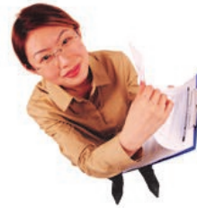
riteSCAN improves inventory accuracy by eliminating paper & pencil processes.