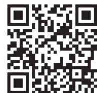
Scan this QR code with your smartphone to visit www.sysprobarcoding.com

Visit www.sysprobarcoding.com for more information and demonstration videos.